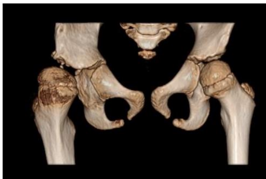
Figure 4: CT of the pelvis – 3D scan carried out at 5 years of age. The relative tilt angle of the femoral head is about 47^\circ ; the angle of internal rotation is about 25^\circ . Knee set in internal rotation. Femoral head in anterolateral subluxation. Joint space significantly widened. Thickening of soft tissues around the hip joint; exudate cannot be excluded. Differentiation reveals postoperative changes and inflammation. The acetabulum is slightly distorted in the area of the roof, and flattened with irregular contours, marginal sclerotization and small defects. A ~4mm calcification or ossification can be seen in the soft tissues in front of the anterior part of the acetabular roof and below the posterior edge of the roof. The femoral head is flattened. There is marked thinning of the bone structure of the femoral head and neck.