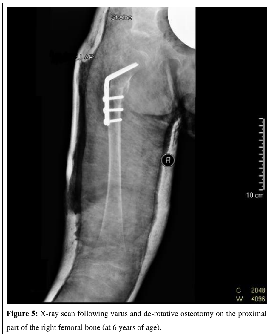
Figure 5: X-ray scan following varus and de-rotative osteotomy on the proximal part of the right femoral bone (at 6 years of age).